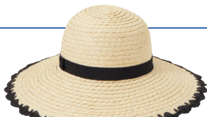
SCALLOP TRIM STRAW HAT £35 MONSOON.CO.UK