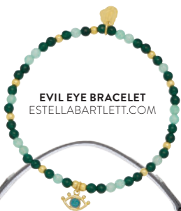
EVIL EYE BRACELET ESTELLABARTLETT.COM