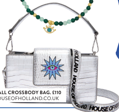
SMALL CROSSBODY BAG, £110 HOUSEOFHOLLAND.CO.UK