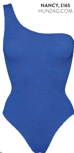
NANCY, £165 HUNZAG.COM