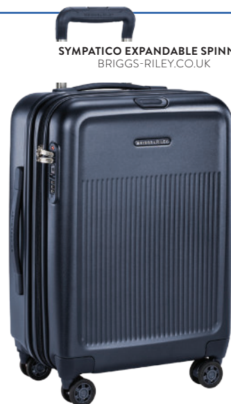
SYMPATICO EXPANDABLE SPINNER BRIGGS-RILEY.CO.UK

Glide effortlessly between islands with the Briggs & Riley Expandable Spinner, featuring exclusive expansion technology for extra packing space and the option to personalize it with your newlywed initials!