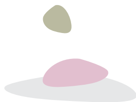
Fig | Honey & pollen cremeux | Namelaka goat cheese Almond praline

Please choose one Starter, one Main Course (Fish or Meat) and one Dessert option 162€ per person